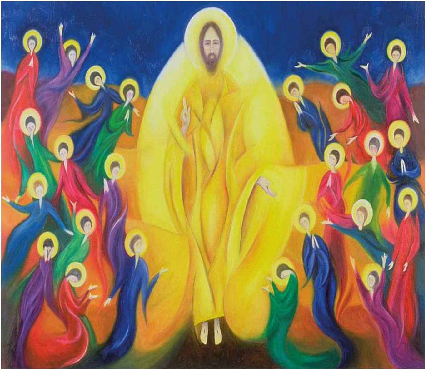
Resurrection Icon (acrylic on panel), Hacker, Sophie (Contemporary Artist) / Cotgrave Church, Nottinghamshire, UK / Commissioned by All Saints Church Cotgrave, Nottinghamshire