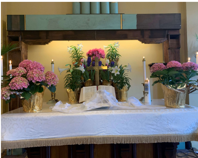
Holy Communion, Easter 2021