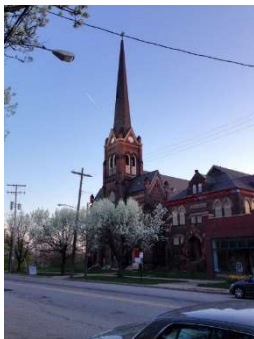
School building built in 1906 - now San Sofia Apartments and Zion Chapel

the 1950's and English services have continued in the years since. An important event in church history, was that Zion Church was the merger site for the union of the Reformed Church and the Evangelical Synod in 1934. After this, the church was known as Zion Evangelical and Reformed Church. In 1957 this Synod merged with Congregational Christian Churches to form the United Church of Christ, and Zion was then called Zion United Church of Christ.