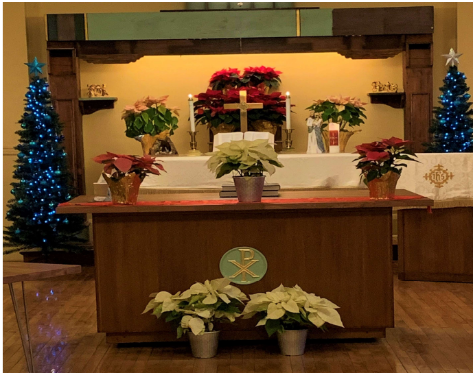
Chapel prepared for Christmas, 2021