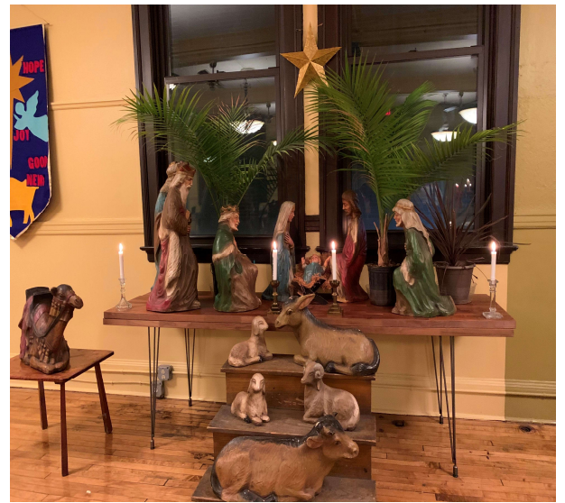
Christmas Nativity - 2021