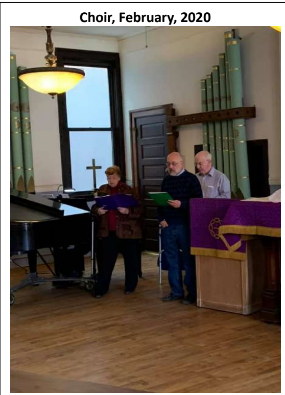
Choir, February, 2020