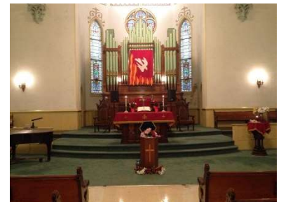
Zion Church sanctuary, 1885-2017 – now site of San Sofia Apartments