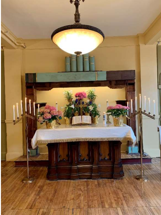
Zion Chapel at 2700 W. 14 th Street in Tremont

The historical Zion United Church of Christ (Zion Chapel), 2700 W. 14 th Street in Tremont (which shares a campus with San Sofia Apartments) will celebrate its 156th Anniversary on Sunday, May 21st with a special Worship Service of Thanksgiving at 11:00 am. A celebratory Reception follows the worship service.