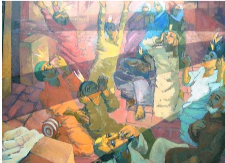
Pentecost, 2013 James Lynch, Oil – Hurtado Jesuit Centre, http://hurtadocentre.org.uk

blood, fire and billowing smoke. 20 The sun will be turned into darkness and the moon will become blood before the coming of the great and sublime day of our God. 21 And all who call upon the name of our God will be saved.'